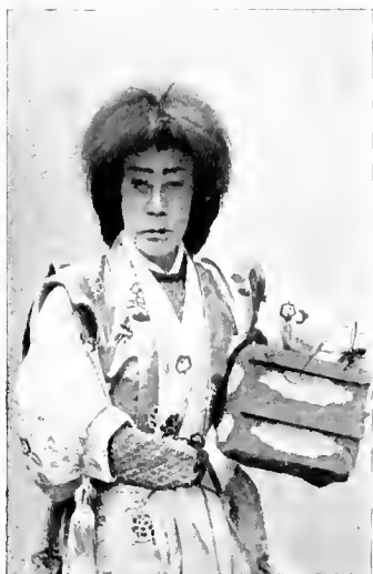
MR. DANJURO AS "FURUYI" (p. 202)